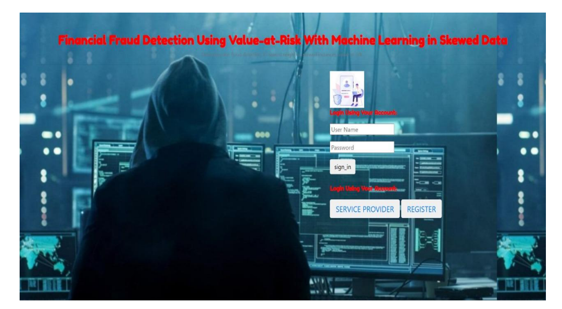
Figure 1. User Interface

The processed results and user interface results are shown in below figures.