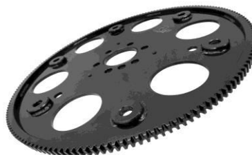
4: Part No 411C311 :-