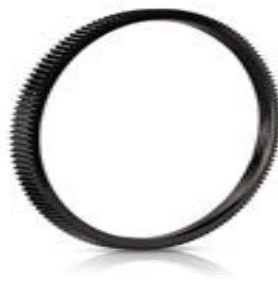
3: 111N2834 :-