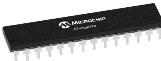
Fig: Atmega 328pr.