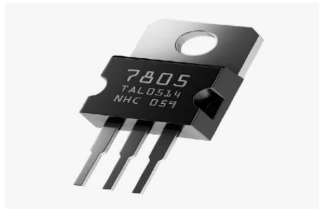
Fig: 7805 voltage regulator.

A 7805 voltage regulator is an integrated circuit designed to maintain a constant output voltage despite changes in input voltage and load. Specifically, the 7805 is a positive voltage regulator that ensures a stable +5V output, making it a popular choice for powering various electronic components and circuits.