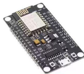
Fig: Esp module

The ESP8266 is a low-cost Wi-Fi microcontroller, with built-in TCP/IP networking software, and microcontroller capability, produced by Espressif Systems[1] in Shanghai, China. The chip was popularized in the English-speaking maker community in August 2014 via the ESP-01 module, made by a third-party manufacturer Ai-