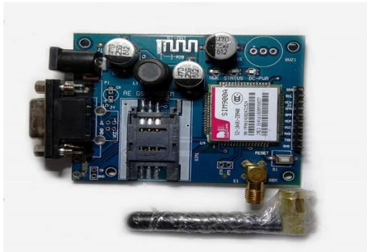
Fig: Sim900A GSM Modul.

Global System for Mobile communication (GSM) is digital cellular system used for mobile devices. It is an international standard for mobile which is widely used for long distance communication. There are various GSM modules available in market like SIM900, SIM700, SIM800, SIM808, SIM5320 etc. SIM 900A module allows users to send/receive data over GPRS, send/receive SMS and make/receive voice calls.