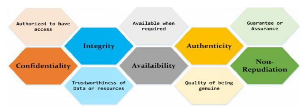
Fig. 1: Elements of Information Security, [source CEH V10 EC, 2018]

Several best practices have emerged to mitigate cybersecurity risks in remote work and cloud computing. These include using multi-factor authentication (MFA), implementing secure virtual private networks (VPNs), enforcing strict access controls, conducting regular vulnerability assessments, and educating employees on cybersecurity hygiene (Biswas et al., 2020).