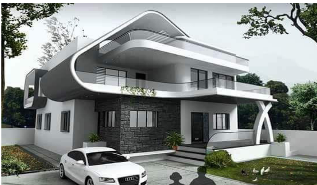
fig 3: final result of g+1 villa