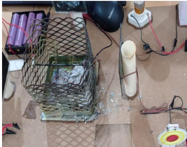
Procurement of components required

The pictures above demonstrate the beginning of our project where we procured the initial components for our project. Then we planned on how to arrange the components for work. Though this was a prototype which showcased our idea on how the project works, we planned on making the better furnace size.. After making the connection, we planned that the dustbin is positioned directly above the zaar box. Then all the necessary electronic components were connected. We made sure that the proper output was met and completed the connections by programming the Arduino