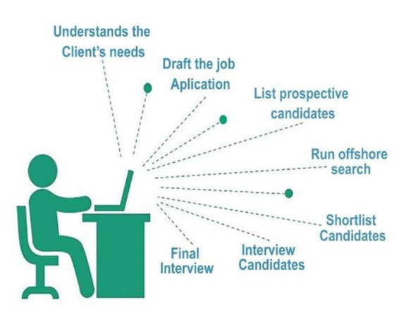
Fig. 2. Feedback Analysis Process for Recruiters

The implementation of the Career Enhancement Platform is designed to integrate various technologies and machine learning algorithms to enhance the overall user experience. The system is built with the goal of providing job seekers with personalized job recommendations based on their resumes, and offering recruiters efficient tools for posting jobs, managing applicants, and analyzing candidate progress.