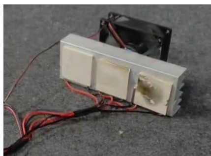
Fig(c) heat conversion using peltier module