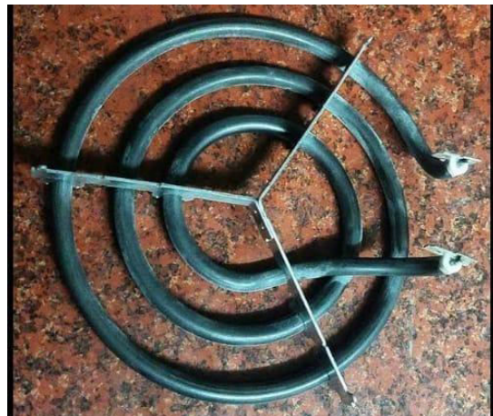
Fig(b) 4 ring tubular heating element