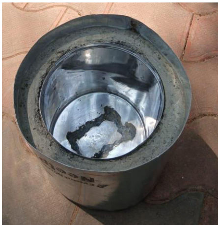
Fig(a) RCC and a layer of ceramic fiber blanket.

Figures shows the components mainly used for implementing a sand battery, Sand is the primary source for energy generation and Fig(a) shows the insulated tank with RCC and a layer of ceramic fiber blanket. the heating coil used in a sand battery. the selected sand is washed dried and sieved to uniform particle a fill inside the tank, then the supply is given to heat it.