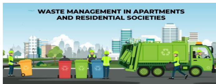
Fig1-Waste Management in Societies

KEYWORDS: Waste automation, Municipal garbage, Societal well-being, Environmental sustainability, Advanced technologies, Collection optimization, Automated sorting, Smart sensors.[1]