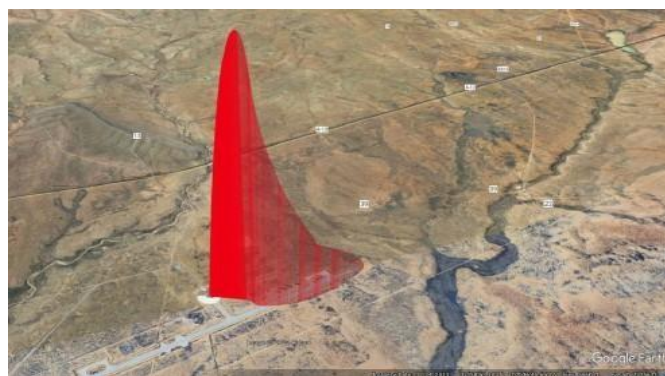
Fig. 3. Real World Simulation

These simulations demonstrated that the missile design was durable enough to resist minor environmental disturbances without a significant loss of planned trajectory. The real- time atmospheric modeling ensured the relevance of the performance metrics for the real world.