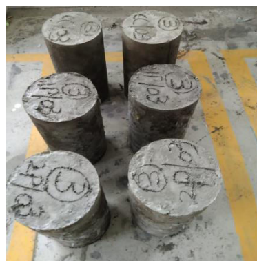
Figure.3. Specimen for testing Split Tensile Strength

It is crucial to test at least three specimens for the appropriate ages in order to determine the split tensile strength for 7 and 28 days. To ensure proper placement of the specimen in the compression testing machine, a diametrical line connecting the two ends of the specimen was drawn before testing. The fabrication and testing procedure has been followed according to IS 516-1959. Fig. 3 shows the casted specimen for testing split tensile strength.