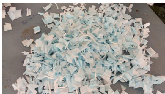
Figure .1. Waste Face Mask Fiber (FMF)

Face Mask Fiber (FMF): Surgical masks were used in this study. The metal nose-fitting piece and the elastic ear bands were manually cut with scissors and discarded, and the filtering parts of the masks were cut into small pieces by means of a paper shredder, passed through in both directions, obtaining small squares. The resulting aspect is given in Figure 1. This material has been labelled as FMF (Face mask Fiber).