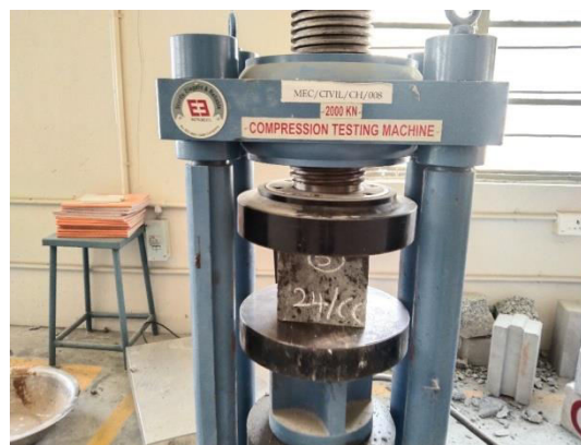
Figure.2. Testing of cube specimen in CTM

According to the IS 516-1959, cube specimens measuring 150 \times 150 \times 150 mm were cast and the natural fine aggregate was replaced 50% by ceramic waste fine aggregate to investigate the compression behaviour of ceramic waste fine aggregate concrete and In addition to that mix used face mask fiber in incorporated in to the concrete with the proportion of 0%, 1%, 1.5% and 2%. Fig. 2 shows the testing of cube specimen in CTM.