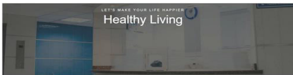
Health Care Center

which included food suggestions, exercise regimens, and required precautions, ensured a comprehensive approach to symptom management and went beyond medical recommendations. By lowering the possibility of negative effects, safety measures like medication interaction warnings and contraindication alerts increased user trust. By using user feedback to improve suggestions, the feedback mechanism further enhanced performance. The system showed flexibility and scalability, which enable it to support more diseases, symptoms, and medications in the dataset, hence making it appropriate for wider applications. The system proven to be a dependable, easy-to-use, and effective tool for enhancing healthcare accessibility and decision-making, with the potential to be used in pharmacies, telemedicine platforms, and health monitoring applications.