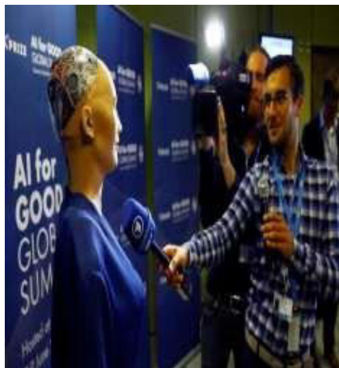
Fig. 4.1 Robo

Social Interaction: Human-robot social interaction plays an essential role in extending the use of robots in daily life. Robots will be able to perform a lot of additional tasks if they possess the gift of social interaction. These robots can be used to help the aged, work with children having autism and patients finding physically or mentally difficult to perform tasks. Rather than mechanically performing tasks, if robots can respond intelligently, use proper body language, smile and react to a joke, accepting robots as part of our daily lives will also become quite easy.