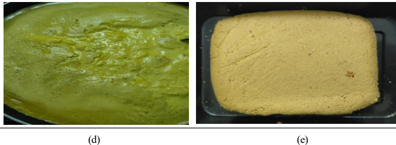
Fig.2:(a)Heating(b)coagulant (lemonjuice) (c) Adding coagulant and stirring(d)Separation(e)Cottonseed cheese