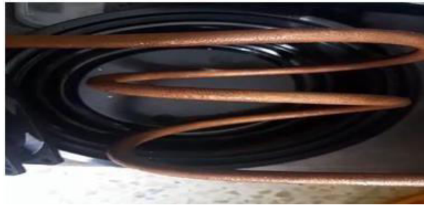
Fig -2: Water droplets on the copper coil

Below are the last test results of your Atmospheric Water Generator (AWG) model on real weather data of Bengaluru for the 3 days. Readings are taken for two time slots per day early morning and afternoon to consider performance at various humidity and temperature. Outputs are proportionately scaled. This table is an indicator to real water yield per hour and is crucial for technical analysis of AWG efficiency.