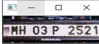
DETECTING LICENCE PLATE