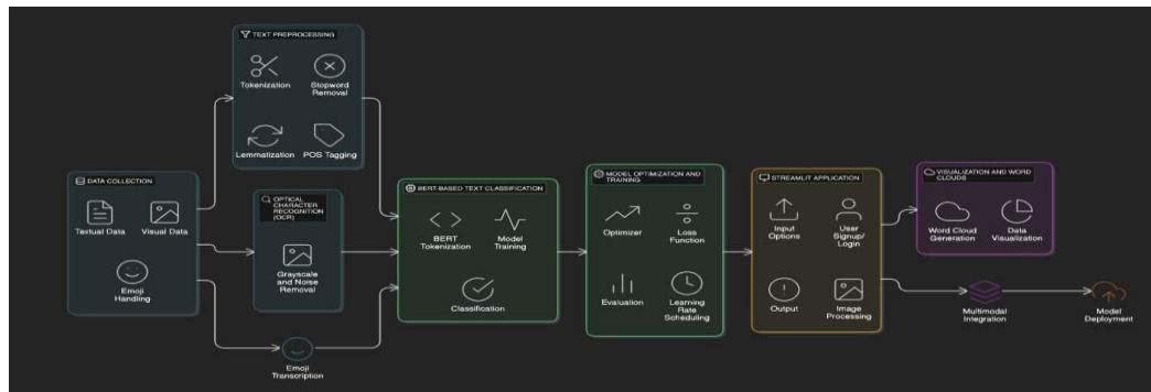
Figure 1: System Architecture

The interface is designed to be intuitive and accessible, requiring minimal technical expertise to operate. The modular architecture ensures scalability and adaptability to new datasets and business requirements