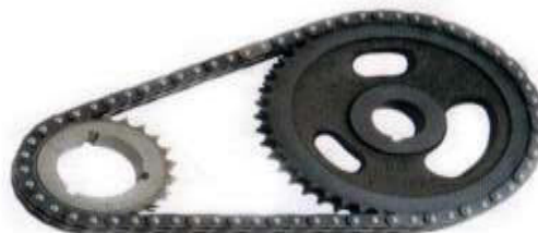
Figure 3.4: Chain and sprocket

Chains have a surprising number of parts. The roller turns freely on the bushing, which is attached on each end to the inner plate. A pin passes through the bushing, and is attached at each end to the outer plate. Chains omit the bushing, instead using the circular ridge formed around the pin hole of the inner plate.