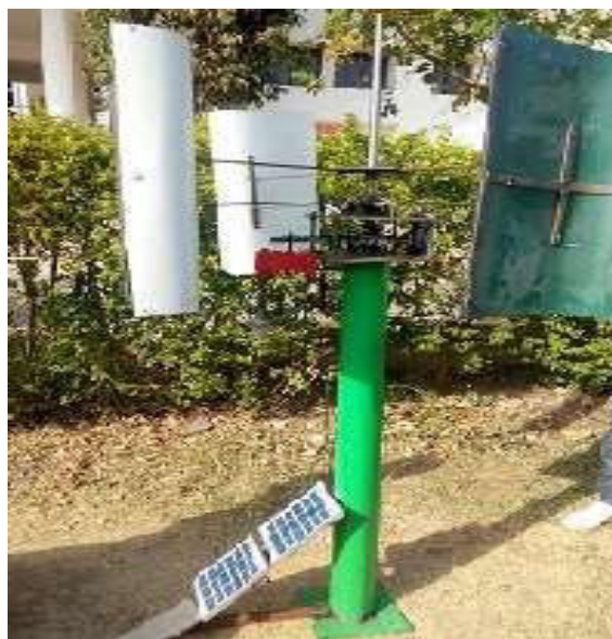
Figure 5.2 Actual overview of the project