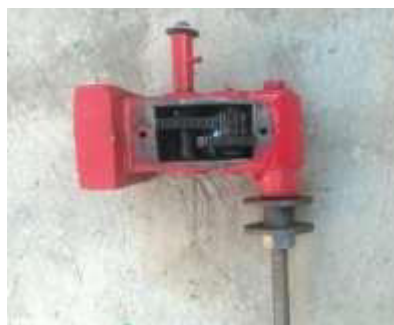
Figure 3.5 Gearbox

Spur gears are most common type of gear. They have straight teeth, and are mounted on parallel shaft. Spur gear are regularly used for speed reduction or increase, torque multiplication. They are most useful component of transmission because variation in counter shaft and main shaft torque is depend upon gear ratio.