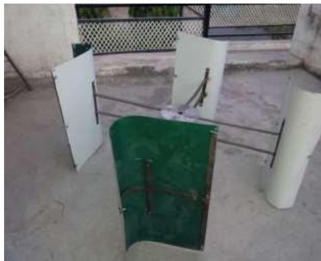
Figure 3.3 Actual wind turbine

Wind turbine is that system which extracts energy from wind by rotation of the blades of the wind turbine. Basically wind turbines two types one is vertical and another is horizontal. As the wind speed increases power generation also increases. The power generated from wind is not continuous its fluctuating. For obtain the non-fluctuating power we have to store in battery and then provide it to the load.