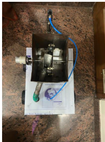
Fig 6 Hopper

Hopper is made by mild C. R. Sheet which contains Seed. There are two hopper mounted on frame on each side. The seeds in the seeds storage tank inserts from the hopper. It is the component from which desired amount of seed can be placed in required field.