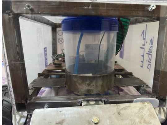
Fig 7 water storage tank