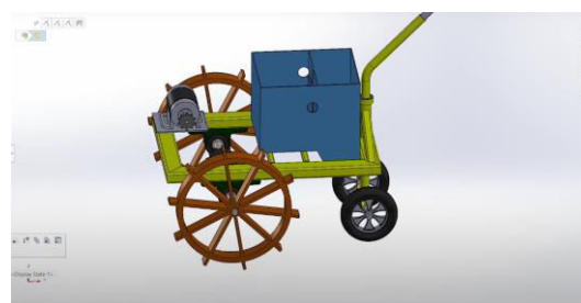
Fig 2 Conceptual CAD model

Create initial sketches and 3D CAD models for the machine, including components like the seed hopper, metering system, wheels, and chassis. Design the layout for IoT components such as sensors, microcontrollers, and communication modules.