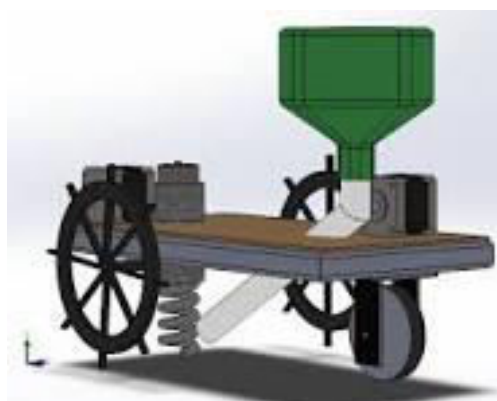
Fig 1 Seeding robot 3d model [1]

As agriculture is extensively supported by technical means like seeding, mowing or harvesting machines, it is widely considered to be a field with a high potential for robotic application as it is a small step from these semi automatically operated machines to fully autonomous robots in both greenhouse and open field applications. Robots are available on all development levels from experimental to market-ready in several agricultural applications but most of them are in research, where institutes have made progress to extend the existing agricultural machines to robotic systems. Most of the robots considered in this publication are developed for harvesting. Seeding is not yet as important since there are already good tractor based seeding systems. In horticulture there are significantly less robotic applications as in agriculture.[1][2]