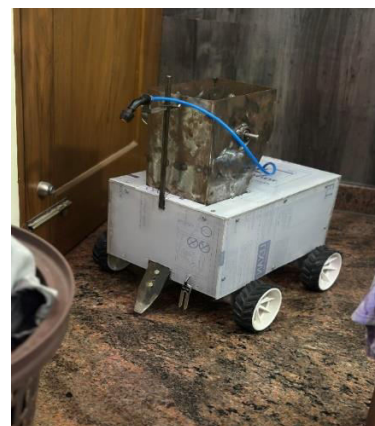
Fig 9 Seed Sowing Machine (Different views)