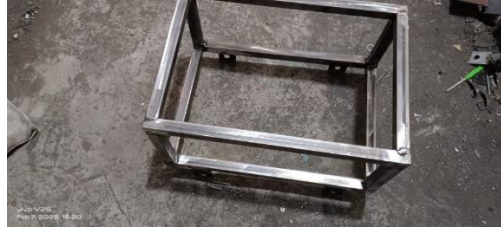
Fig 3 Framework/chasis

Install DC or stepper motors for the drive system and seed metering mechanism. Connect the motors to motor drivers and ensure precise control using microcontrollers.