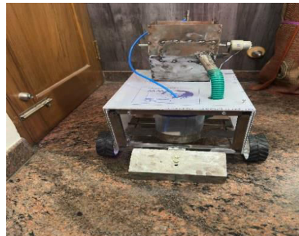
Fig 8 water storage tank