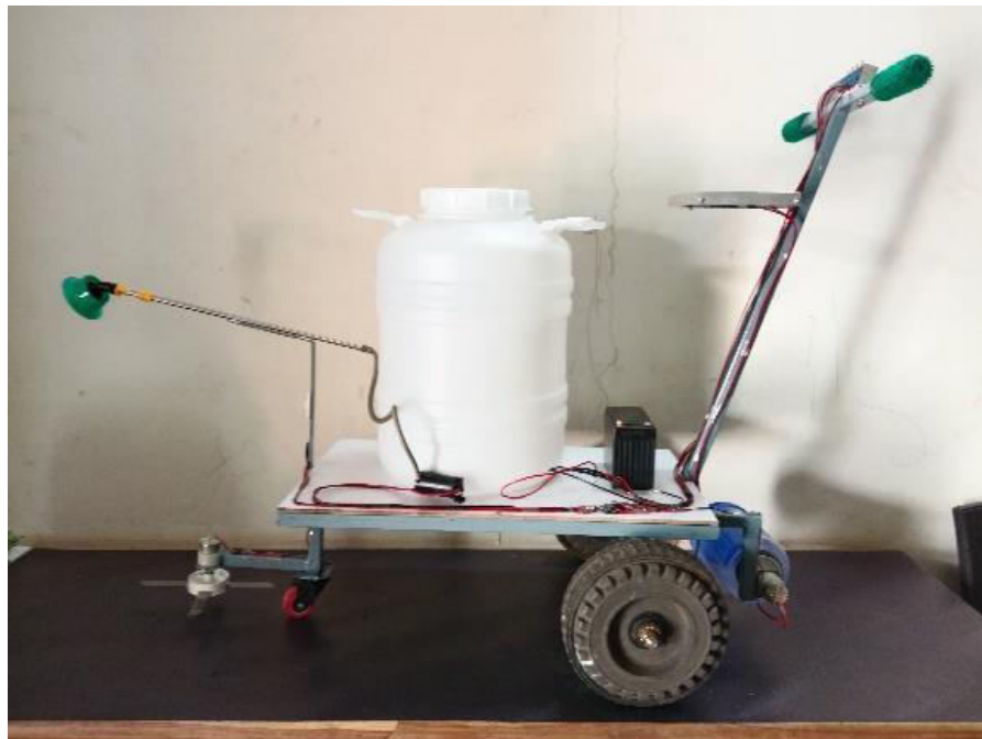
Fig. 2 Working Model

The show works as takes after, the hardware works by physically pushing it forward utilizing handles, which causes the front wheel to pivot. A equip mounted on the wheel hub exchanges movement to a pinion by means of a chain drive. This revolving movement is changed over into responding movement through a single slider wrench component, moving a interfacing bar up and down. This activity drives a single-acting responding pump mounted on best of the pesticide capacity tank—drawing pesticide in on the upward stroke and constraining it out through a conveyance valve and nozzle-equipped pipe on the descending stroke. Moreover, the venture incorporates a solar powered grass cutting machine. It employments an engine associated to a equip course of action and cutting edge. The engine shaft is bolstered by a bearing framework for smooth turn. As the engine runs utilizing sun powered vitality, it turns the shaft, which in turn drives the cutting edge by means of the adapt setup, successfully cutting grass in the field.