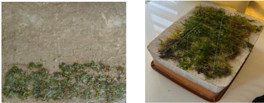
Fig.1.0. Making of Moss Concrete

The methodology for creating moss concrete involves a systematic approach combining conventional concrete practices with biological integration techniques. The process begins with the collection of materials required for casting concrete cubes of various grades such as M20, M25, and M30. The primary materials include Ordinary Portland Cement (OPC) or eco-friendly alternatives, fine and coarse aggregates like sand and gravel, and clean potable water. These components are carefully mixed in specific ratios depending on the grade of concrete: M20 (1:2.13:2.93), M25 (1:1.9:2.62), M30 (1:1.6:2.34) and M40. After thoroughly mixing the concrete, it is poured into standard cube moulds and cured properly to ensure hydration and strength development.