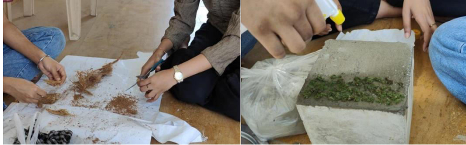
Fig.1.1. Making of Moss Concrete

In addition to monitoring the moss development, the moss-grown concrete cubes are tested for various physical properties. Compressive strength is assessed using a compression testing machine, while thermal insulation is evaluated using a metallurgical thermometer. The tests reveal that moss concrete not only maintains or slightly improves its strength over time but also significantly reduces surface temperature compared to regular concrete. This temperature regulation, observed to be up to 4–5°C cooler, contributes to reducing the urban heat island effect. The overall results demonstrate that moss concrete provides enhanced durability, temperature control, and eco-friendly benefits, making it a promising sustainable material for the future of construction.