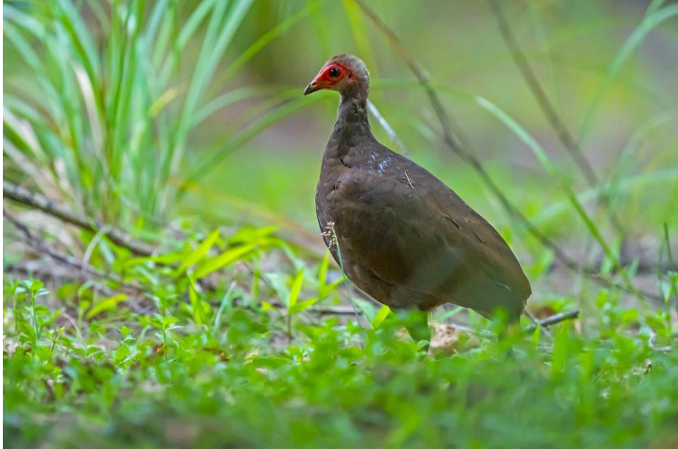
Figure 4. Nicobar Megapode — Mound Nesting

Unique mound-building behavior makes this species dependent on undisturbed coastal forests [12].