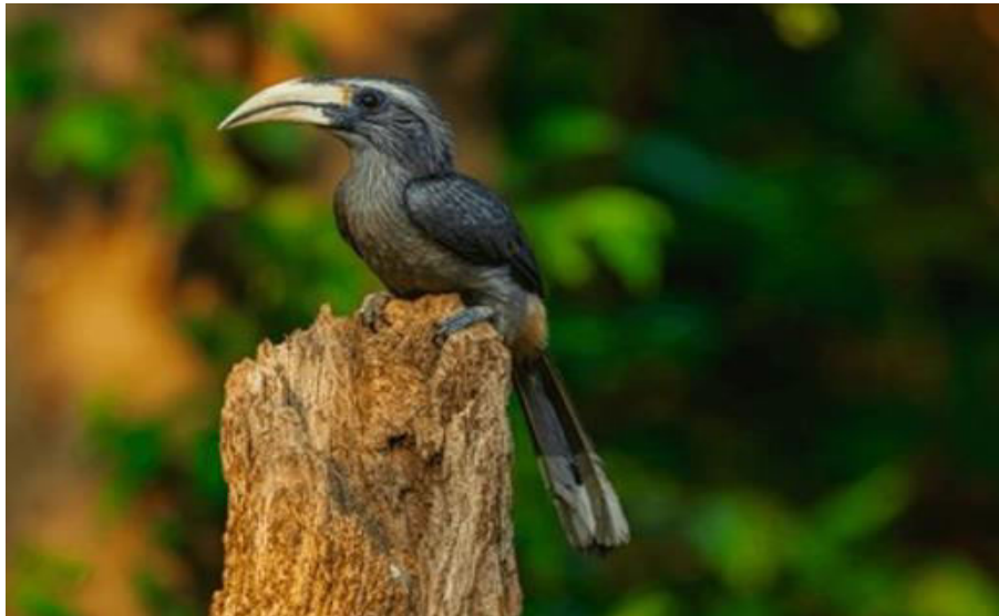
Figure 2. Malabar Grey Hornbill — Seed Dispersal Role

This species exhibits behaviors typical of flycatchers but also has unique foraging habits.