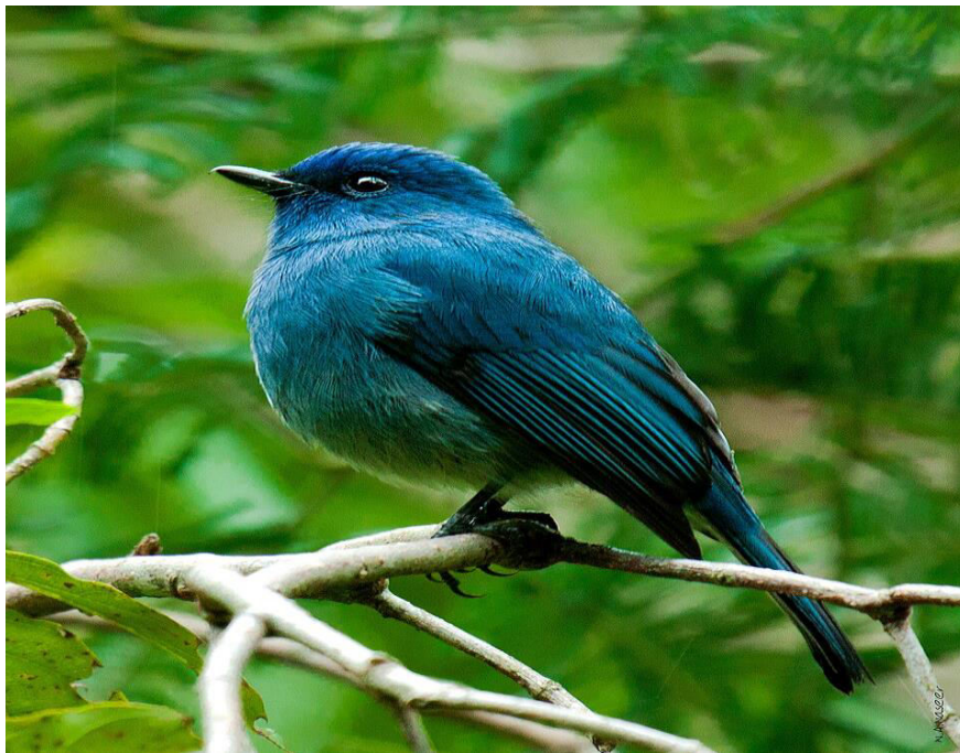
Figure 1. Nilgiri Flycatcher — Habitat and Behaviour

Microclimatic variables such as canopy humidity, leaf litter depth, and understory density were significantly correlated with species presence ( p < 0.01 ).