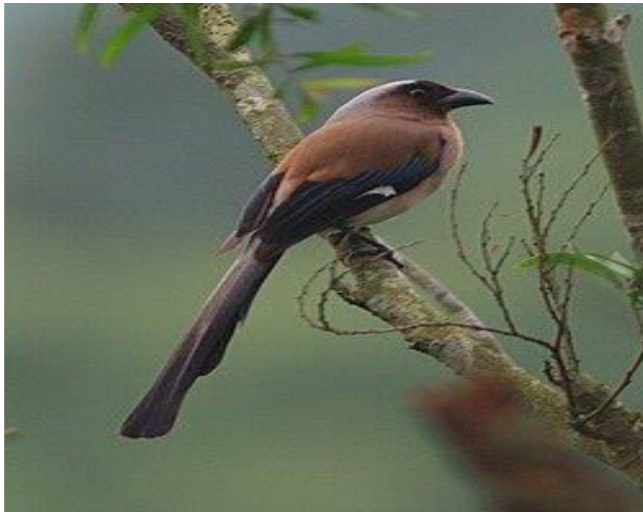
Figure 3. Andaman Treepie — Island Endemism