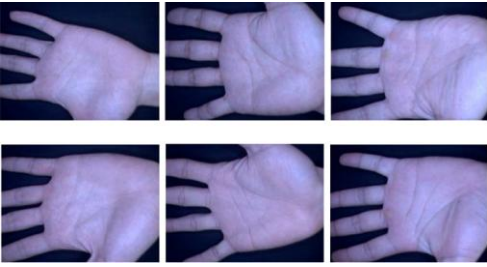
Fig. 2 PolyU Palmprint Database

PolyU palmprint database consists of 6000 images from 500 different palms for one illumination. The images were collected from 195 males and 55 females in two separate sessions. The volunteers ranged from 20 to 60 years of age. In each session, 6 images were captured for each palm. The next session was held after about 9 days from the first session. This database employs user pegs to restrict the hand orientation. This helps in achieving significantly higher performance. Therefore, this database is used widely.