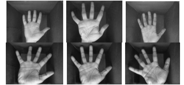
Fig.3 IITD Palmprint Database

IITD palmprint database uses a touchless imaging setup. It was acquired from the staff and students of IIT Delhi during July 2006 – June 2007. The available database is of 235 users. Each image is of bitmap (*.bmp) format. 7 images were captured of both the palms, leaft and right each from each user in varying hand pose variations. The touchless imaging results in higher image scale variations. The resolution of the captured images is 800 X 600 pixels. Along with the cpturd images, the 150 X 150 pixels cropped and normalised images are also available. The database is acquired in the indoor environment with a circular fluorescent illumination around the camera.