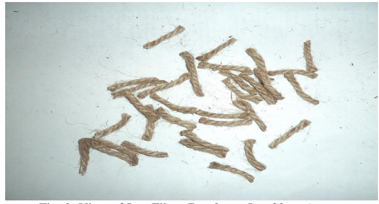
Fig. 2: View of Jute Fiber (D = 2mm, L = 30 mm)