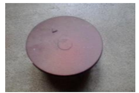
Figure 2 After Copper Coating