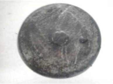
Figure 1 Before Copper Coating

• Cleaning & mask removing: After complete the Plasma spray process allow some time to dry condition after that remove clean the parts. the below Figure 1 show piston head before coating the below Figure 2 show piston head after coating the below Figure 3 Coated Piston Crown and Cylinder Head Bottom used for the experimental set up.