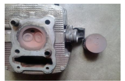
Figure 3 Coating on Piston Crown and Cylinder Head Bottom