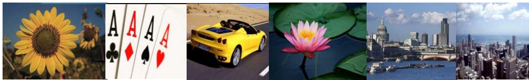
Figure 1. Sample Images of test database

A collection of around 650 images are taken randomly from the web as the image database. The system is developed in MATLAB7.3. The histograms for all the images were in 72 color bins in HSV color space. The performance metrics taken for evaluation is precision-recall measure and retrieval time.