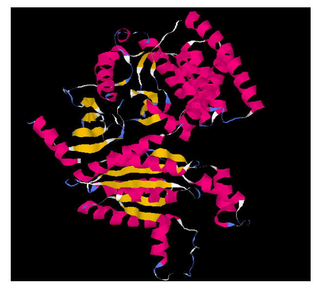
FIG 5:ENERGY MINIMIZED FIRST MODEL FROM ROBETTA SERVER

(An ISO 3297: 2007 Certified Organization) Vol. 2, Issue 9, September 2013